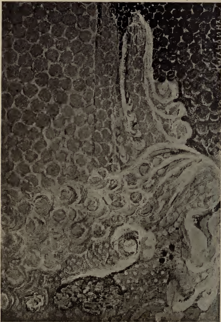
A SCENE DESIGN BY THE ARTIST, N. I. KULBIN, FOR ACT II OF THE MONODRAMA, "THE REPRESENTATION OF LOVE," BY NIKOLAI NIKOLAIEVITCH YEVREYNOFF

The "I"—"Is it you I am embracing? . . . Yes? . . . Is your hair perfumed? . . . Do I hear your breath? . . . Yours? . . . Yes? . . . Yes, it is you, you! . . . You? . . . No, do not resist! . . . Listen, listen . . . (I still say something, but what,—I do not understand, I do not know, I do not hear. In the dark fog, still, there is distinct green gold . . . Either it curls or freezes on the spot. . . Envelopes, shrivels . . . Dies in a minute of darkness, comes to life again, grows pink, purple, makes odd designs, tinkles with opalescent murkiness, waits an unearthly charm, rains, becomes an ocean, warms with colors)." 1