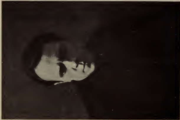
MIHAIL ALEXANDROVITCH TCHEHOFF, NEPHEW OF THE PLAYWRIGHT

LEADING PLAYERS TRAINED IN THE FIRST STUDIO OF THE MOSCOW ART THEATRE