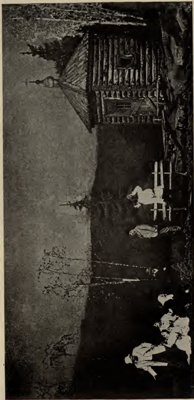
A SCENE FROM ACT II OF TCHEHOFF'S "THE CHERRY ORCHARD" AT THE MOSCOW ART THEATRE