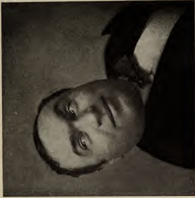
N. F. BALIEFF, RUSSIA'S GREAT ARTIST-CLOWN AND FOUNDER OF Letutchaya Muish, THE Chauve- Souris OR THE BAT, MOSCOW'S SUPER-CABARET