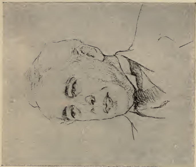
CONSTANTIN SERGIEVITCH STANISLAVSKY, FIRST ARTIST AND PRESIDENT OF THE COUNCIL, MOSCOW ART THEATRE