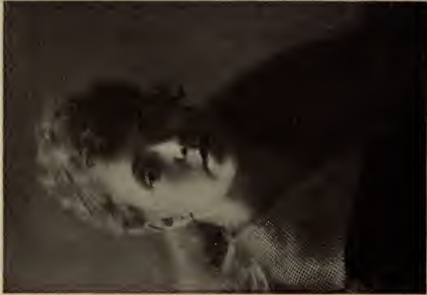
OLGA VLADIMIROVNA BAKLANOVA