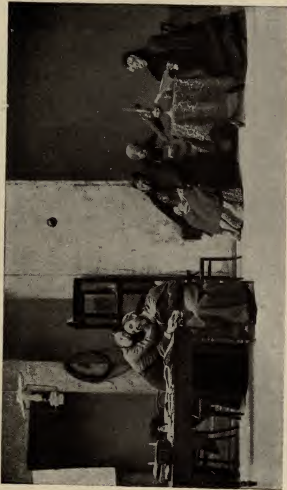
THE FINAL MOMENTS OF ACT IV OF TCHEHOFF'S "UNCLE VANYA," AT THE MOSCOW ART THEATRE From Theatre Arts Magazine