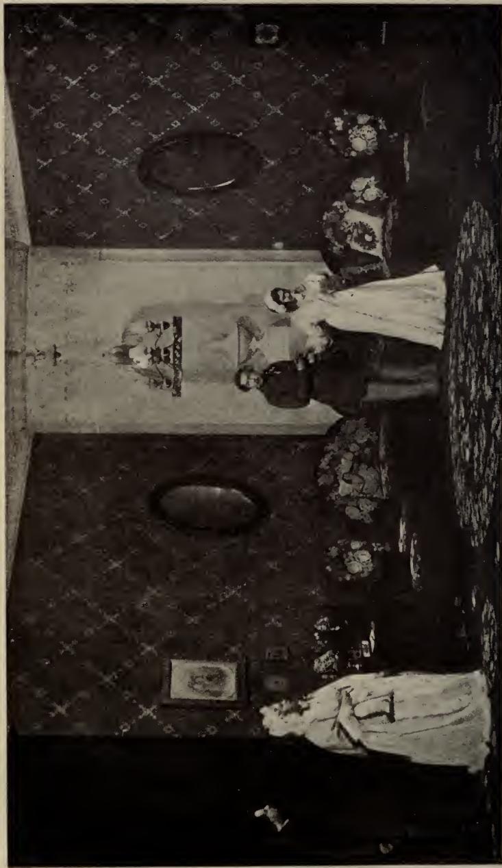
A SCENE IN ACT III OF TURGENIEFF'S ROMANTIC COMEDY, "A MONTH IN THE COUNTRY," AT THE MOSCOW ART THEATRE. STANISLAVSKY AS RAKITIN AND KNIPPER AS MME. ISLAIEVA IN THE CENTER