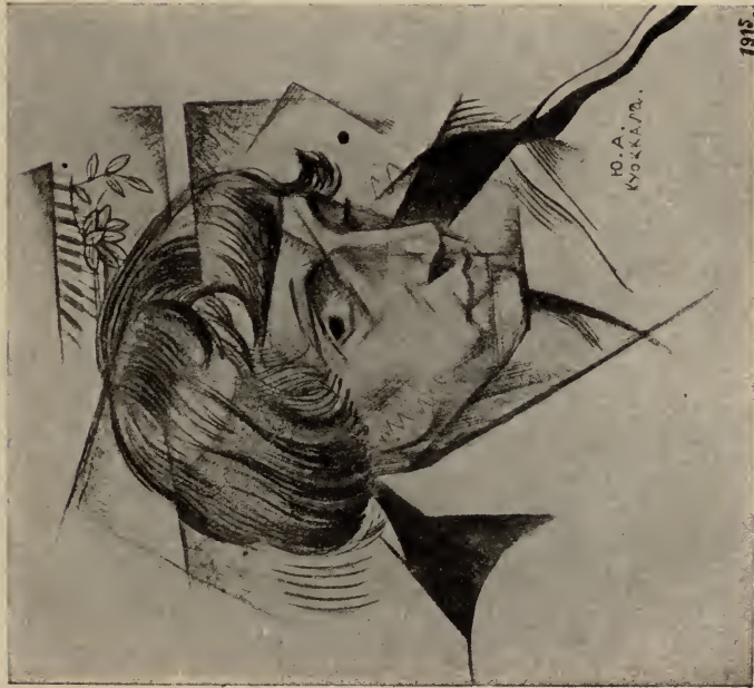
FROM A SKETCH BY ANNYENKOFF

TWO PORTRAITS OF NIKOLAI NIKOLAIEVITCH YEVREYNOFF, PLAYWRIGHT, PRODUCER AND PROPONENT OF MONODRAMA