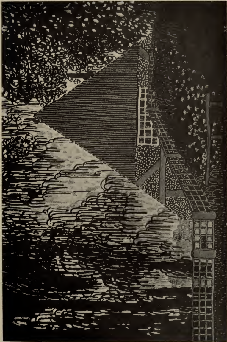
Drawn by Jacques Rouché after design by Yegoroff; from Theatre Arts Magazine "THE BLUE BIRD" AT THE MOSCOW ART THEATRE. "THE FAREWELL"