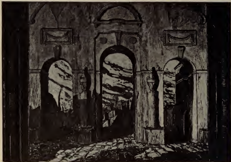
SETTING FOR ACT I