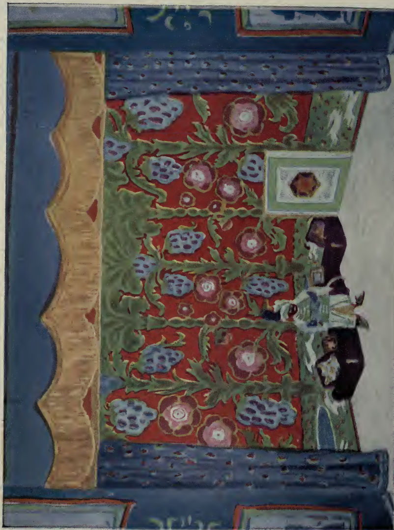
From Kenneth Macgowan's "The Theatre of Tomorrow"—Boni and Liveright ALEXANDER BENOIS' DESIGN FOR THE SETTING OF THE THIRD ACT OF "PETRUSHKA," PEAK OF THE DIAGILEFF REPERTORY AND OF THE ENTIRE RUSSIAN BALLET, WITH