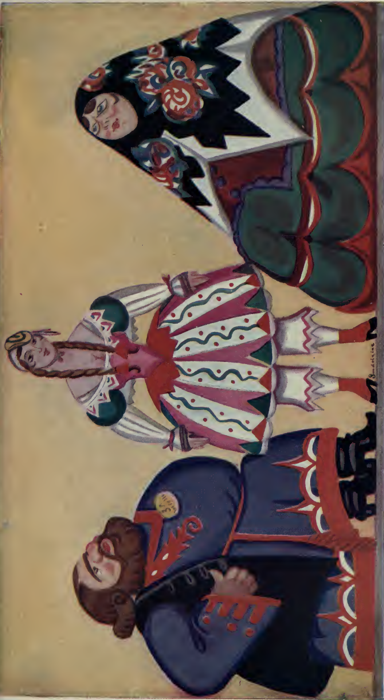
SERGEI SUDEYKIN'S DESIGN FOR "KATINKA," THE PERT AND PICTURESQUE POLKA OF BALIEFF'S Chaucé-Souris , DONE IN THE STYLE OF THE MUSIC BOXES CARVED AND DECORATED BY THE MUZHIK