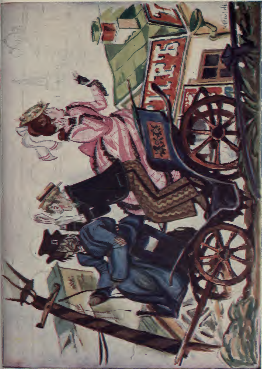
NICOLAS REMISOFF'S DESIGN FOR "THE SUDDEN DEATH OF A HORSE, OR THE GREATNESS OF THE RUSSIAN SOUL." A WHIMSICAL FARCE BY ANTON TCHEIEHOFF IN THE REPERTORY OF BALIEFF'S