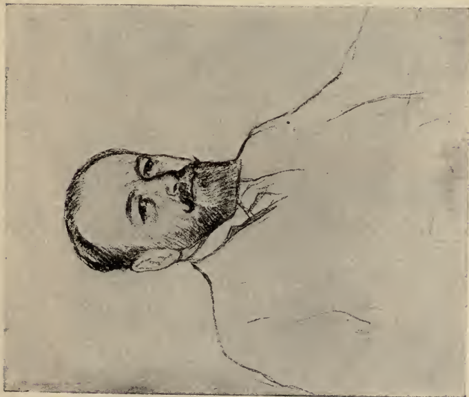
VLADIMIR IVANOVITCH NYEMIROVITCH-DANTCHENKO, PRESIDENT OF THE DIRECTION, MOSCOW ART THEATRE