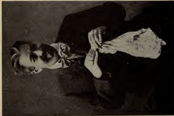
AS GAIIEFF IN TCHEHOFF'S "THE CHERRY ORCHARD",

STANISLAVSKY IN TWO OF HIS FAVORITE RÔLES AT THE MOSCOW ART THEATRE