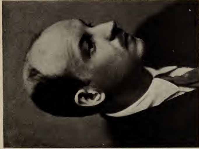
FYODOR KOMMISSARZHEVSKY, DIRECTOR OF THE THEATRE IN MEMORY OF HIS SISTER, THE GREAT ACTRESS, VERA KOMMISSAR- ZHEVSKAYA