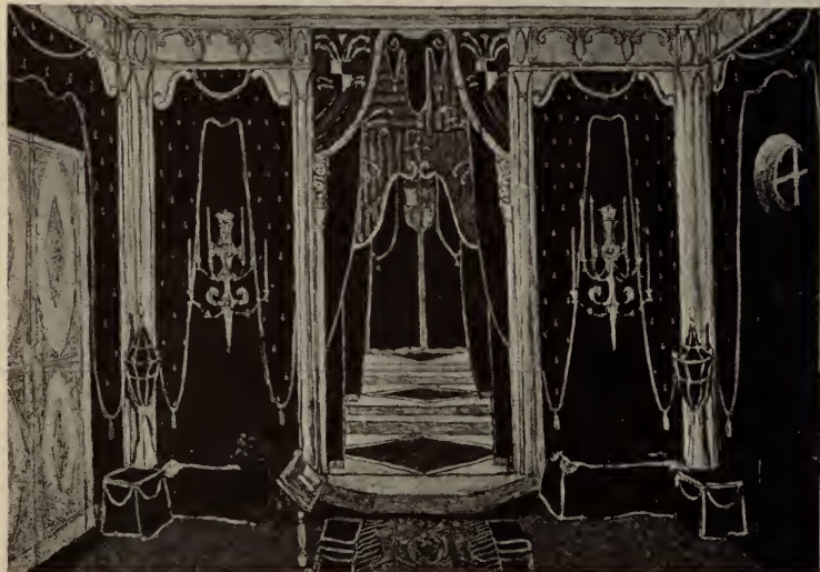
SETTING FOR ACT IV

SCENE DESIGNS BY GOLOVIN FOR MEYERHOLD'S PRODUCTION OF THE OPERA, "THE STONE GUEST," TEXT BY PUSHKIN AND SCORE BY DARGOMUIZHSKY, AT THE MARINSKY THEATRE, PETROGRAD