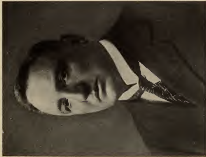
PRINCE ALEXANDER IVANOVITCH SUMBATOFF (YOUZHIN), DIRECTOR OF THE SMALL STATE THEATRE, MOSCOW