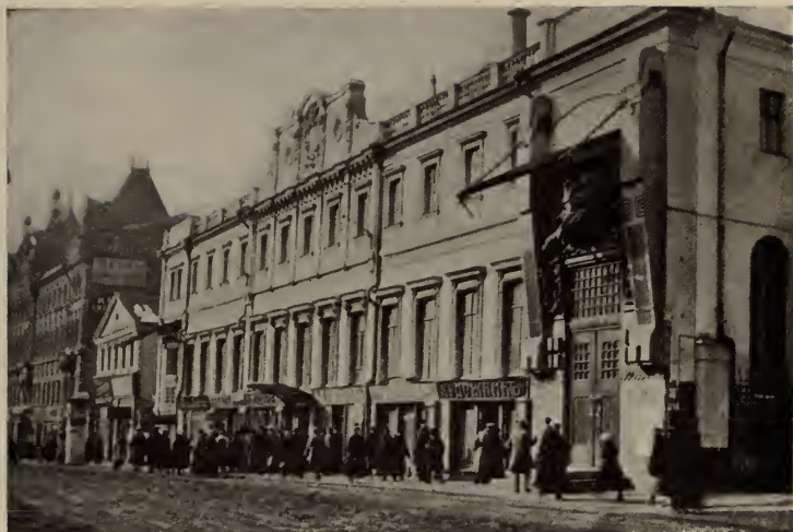
FAÇADE OF THE MOSCOW ART THEATRE IN KAMERGERSKY PEREULOK