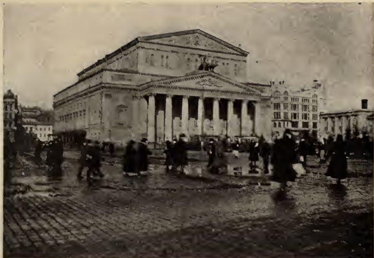
THE GREAT STATE THEATRE, MOSCOW